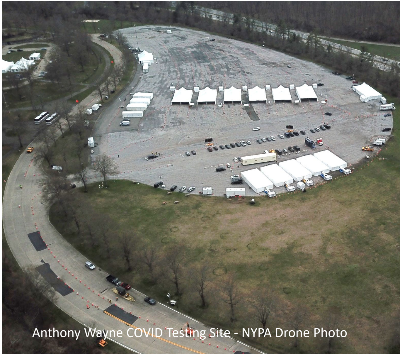
Anthony Wayne COVID Testing Site